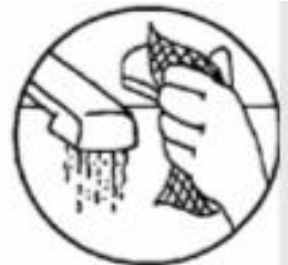
6. TURN OFF WATER WITH PAPER TOWEL